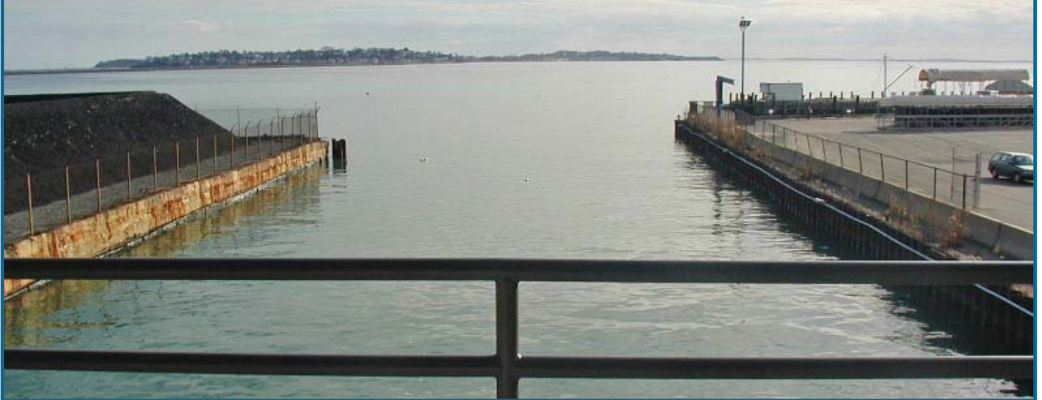
Ocean view from the conference room